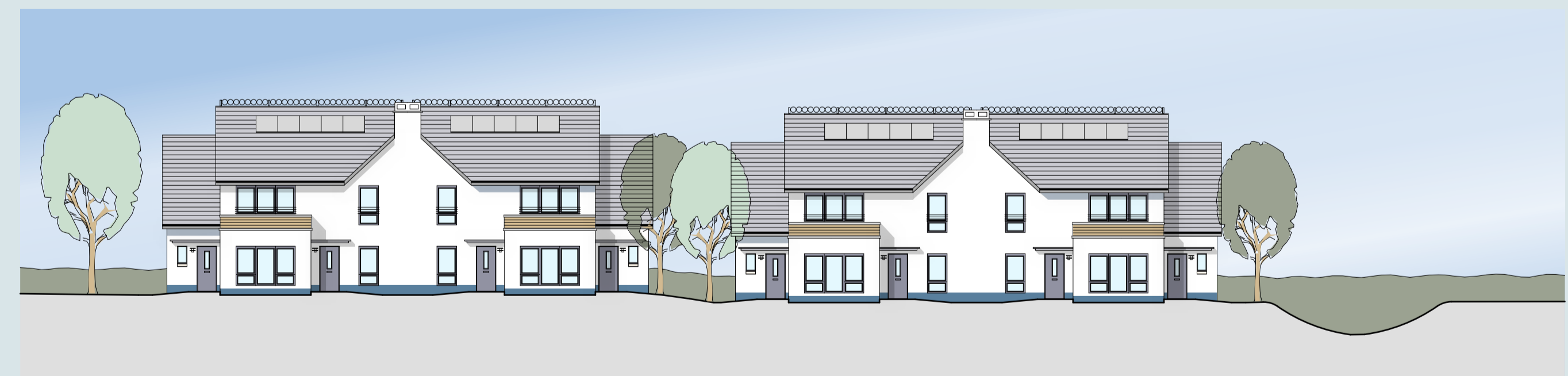
TYPICAL STREET ELEVATION 1:200