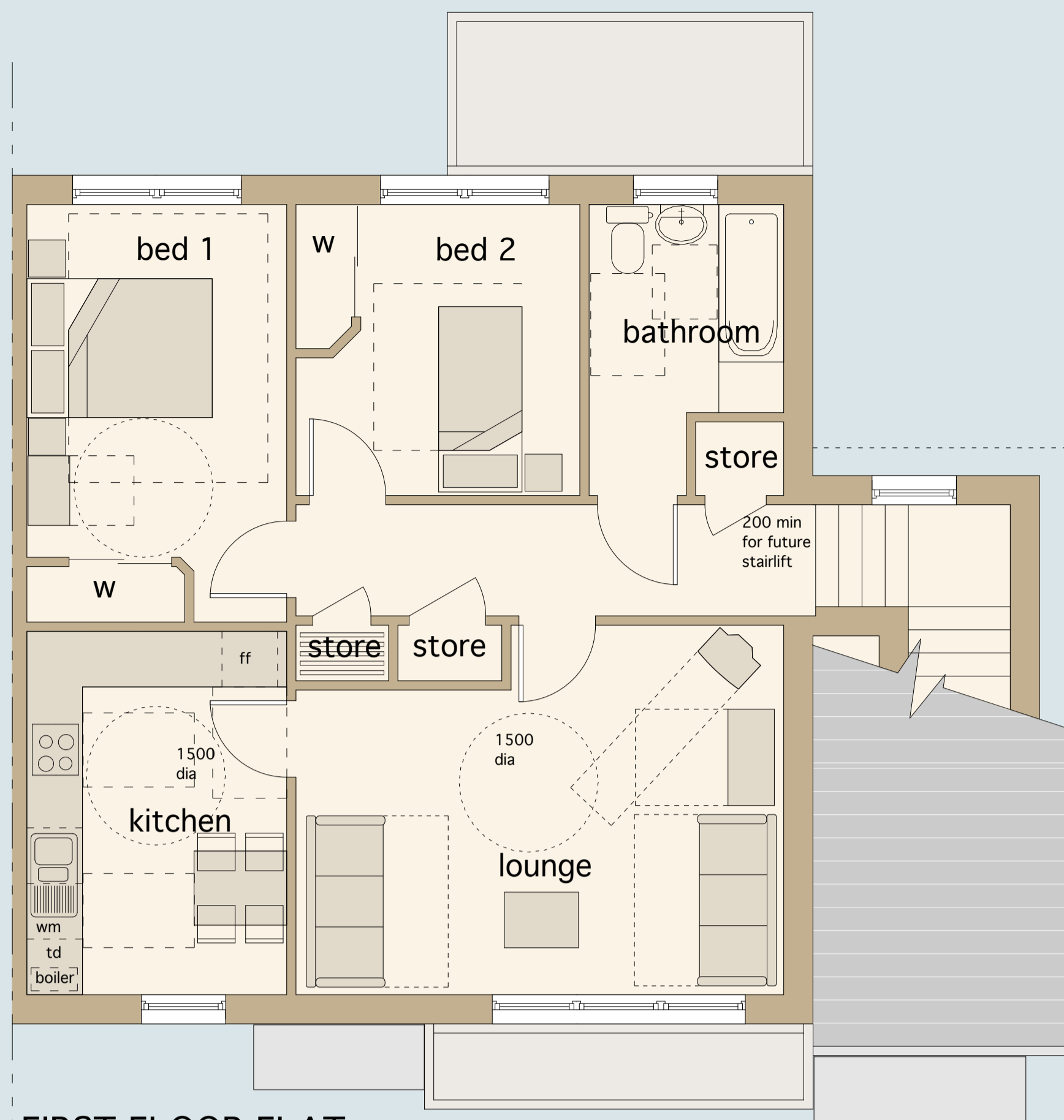
FIRST FLOOR FLAT 1:50