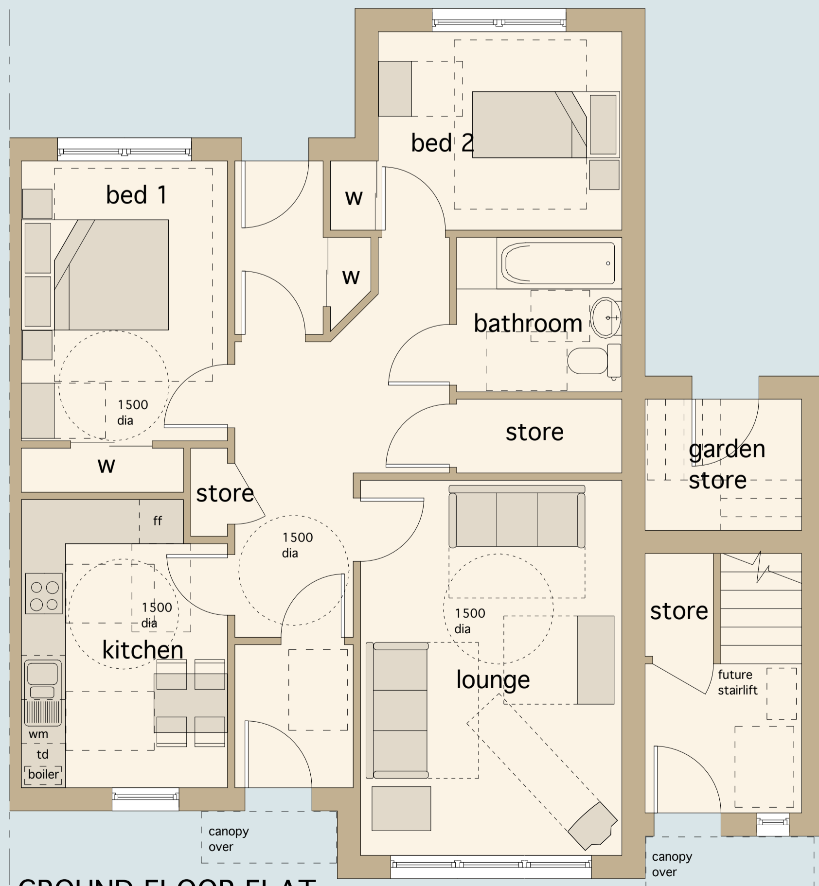
GROUND FLOOR FLAT 1:50